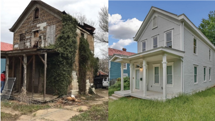
Before and after photo of 1326 Valley Place, SE, one of the Trust's completed Historic Properties Redevelopment Program projects.

Help protect Anacostia's unique heritage and community history, increase affordable housing stock, and support community revitalization efforts by supporting The L'Enfant Trust today.