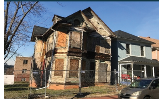
Big Green: The L'Enfant Trust's upcoming historic rehabilitation project.